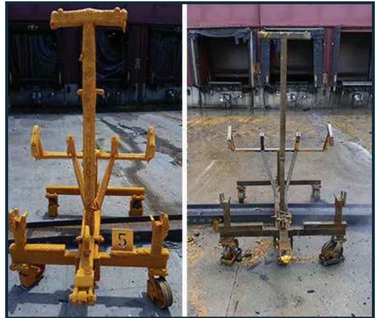
ABOVE: (L) Before and (R) after photos of paint cart.

Strength H2O also cleaned front and rear chassis carts. These carts were also cleaned with 40k psi hydro-blasting. Previously, the process took four (4) hours to complete; Strength was able to fully clean the carts in an average of twelve (12) minutes.