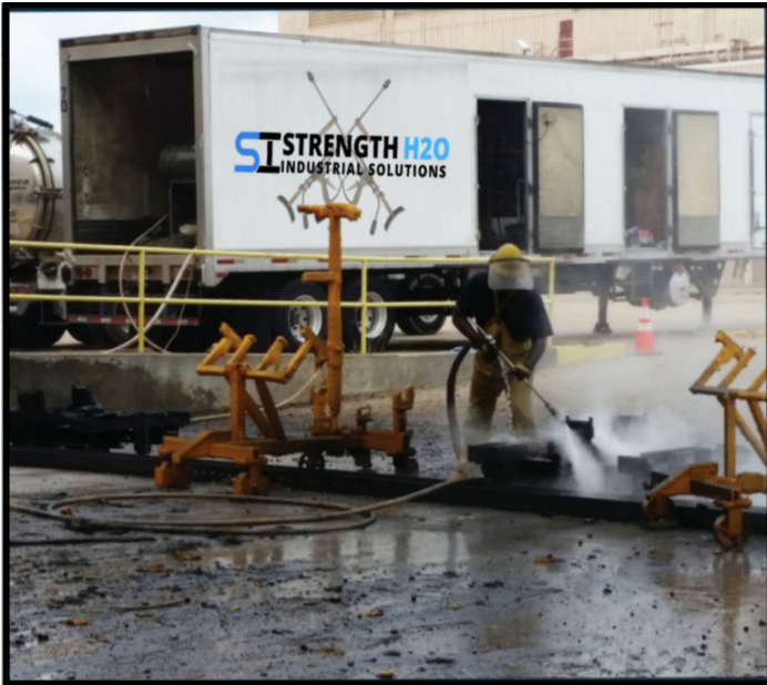
ABOVE: Blasting of the chassis carts with 40k psi hydro-blaster.